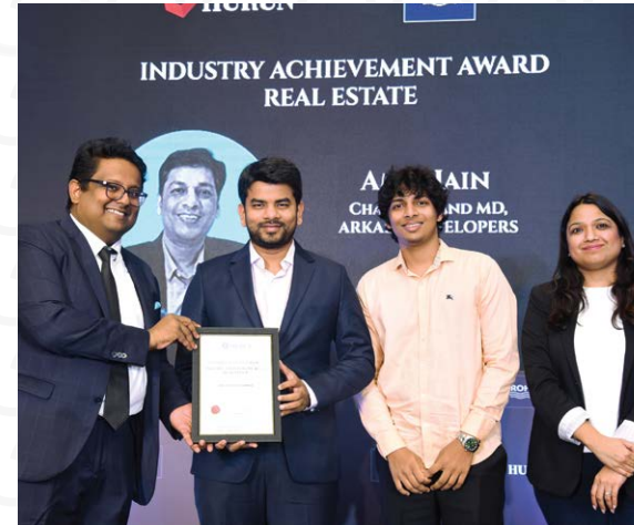
INDUSTRY ACHIEVEMENT AWARD REAL ESTATE Grohe Hurun India 2024