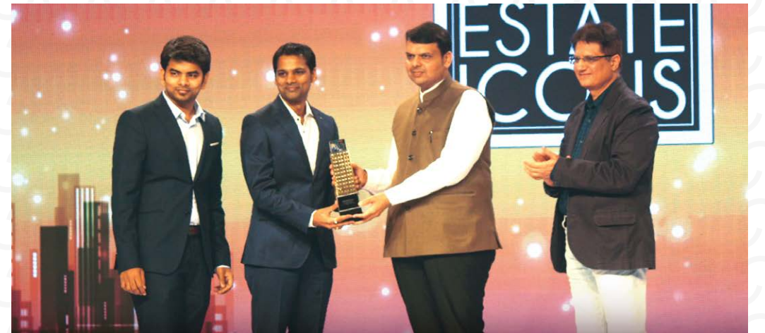
PROJECT OF THE YEAR AWARD - ARKADE EARTH Mid-Day Real Estate Icons 2018