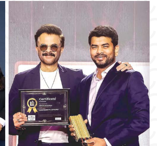
ICONIC RESIDENTIAL DEVELOPER Times Real Estate Conclave Awards 2024