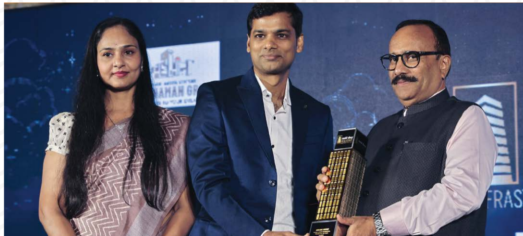
ICONIC LUXURY RESIDENTIAL PROJECT OF THE YEAR - ARKADE AURA Mid-Day Real Estate & Infrastructure Icons 2024